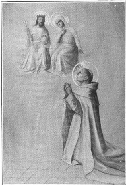
The Blessed Virgin Presenting St. Dominic to Her Son

Now, St. Paul is very explicit in telling us that we have a double vocation. First of all, he assures us that we are called to be saints. This, then, is our general or common vocation. But in striving to fulfil it we most surely arrive at a knowledge of and correspondence with our specific vocation. So with the religious Orders. They all have one great end. Their common vocation is identical with that of the Mother Church which nourishes them. But, like individuals, they, too, have been assigned special fields wherein to labor. Hence, the Church has been compared to a garden, and the Orders and Confraternities that multiplied so rapidly in her fertile soil have been likened to flowers and trees. All draw their sustenance from the same earth, grow strong under the sunlight of God's love and the rains of His mercy. No two are alike, yet their very variety makes beautiful the garden. Some grew as fair, pale blossoms, shed quickly their perfume, and died. Others—and one such is the Order whose vocation we shall consider—taking deeper root, have grown into mighty trees, the shade of whose branches has spread into the garden's furthest corners.