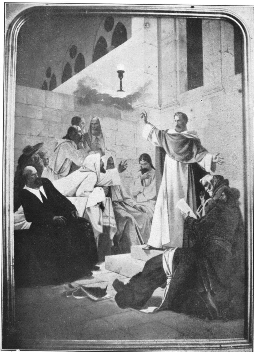
St. Dominic Preaching to the Albigenses—Dominican Church, Naples

ing of his future vocation. His whole life shows him to have been the Lord's watch-dog, jealous to defend His truth. In his mouth he carried