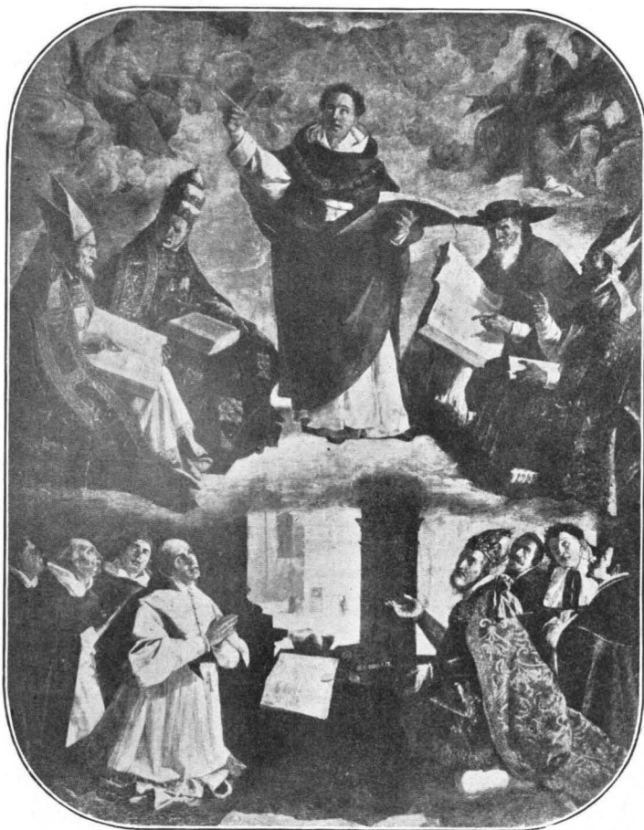
St. Thomas Among the Doctors—Zurbaran

Truth, and with their hearts still fired with zeal for it, they go forth to preach it to others. "Order of Preachers" a Vicar of Christ christened them, and by this title are they known to all men. In St. Hyacinth we see the apostle of the whole Polish nation; in St. Vincent Ferrer, the Angel of the Judgment; in Savonarola, the much maligned reformer of worldly-minded Florence; in Lacordaire, the modern apostle of atheistic Paris; Monsabre, the man who popularized theology; in Tom