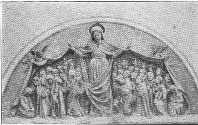
Under Our Lady's Cloak