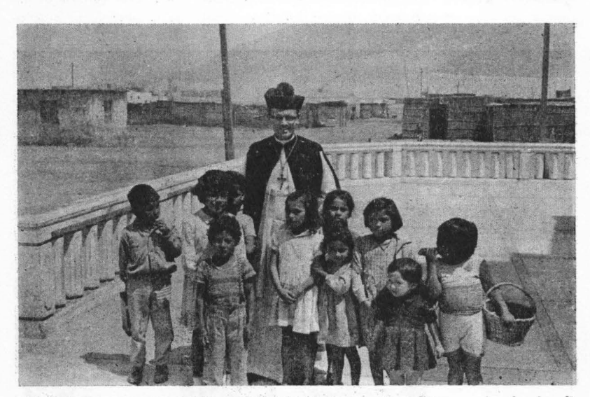
Msgr. stops to chat with some of his younger parishioners. In the background, typical Chimbote houses.

As to which of these projects is most significant, the Msgr. commented only that ". . . any step forward here, every step, is of vital importance. One thing is for sure. If any real progress is to be made at all, it cannot be done by the missionary alone. It must be accomplished through the prayers and support of our people at home, and in fact, of all the peoples of the Church. Latin America today represents one of the greatest hopes of the Church and the world, if its problems can be successfully