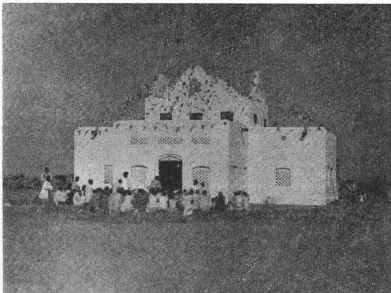
ST. JUDE'S CHURCH

About seventy miles Northwest of Multan, West Pakistan, and four miles West of the Indus River, there is a small, dusty village called Rangpur. Its people, 350 of them, are mostly sugar cane farmers, "squatters," who live from hand to mouth, and have no legal title to the land they work. Since 1955, a number of laymen and clergy have been fighting to obtain proprietary rights for them, but still there is no success. As things stand now, the people of Rangpur can count on one meal a day, today; they can count on nothing tomorrow, for by then they may be dispossessed of all they have.